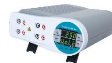
Power Supply for Electrophoresis System