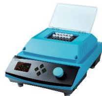
Heating & Cooling Block