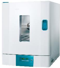
Forced Convection Oven

*Click below pictures and review its web pages.