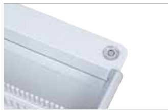
Equipped with a spirit level Anti-slip rubber feet (EP-10, EP-18 models)