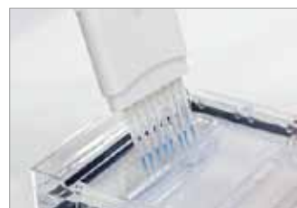
Easy to measure the thickness of gel due to engraved level marker