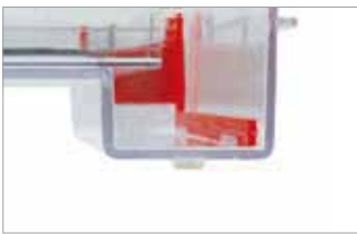
Anti-slip rubber fee