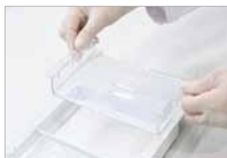
Observe the gel conveniently without separating it from tray