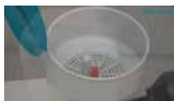
Level indicator operation of Lab Companion Safety Funnel for waste disposal.